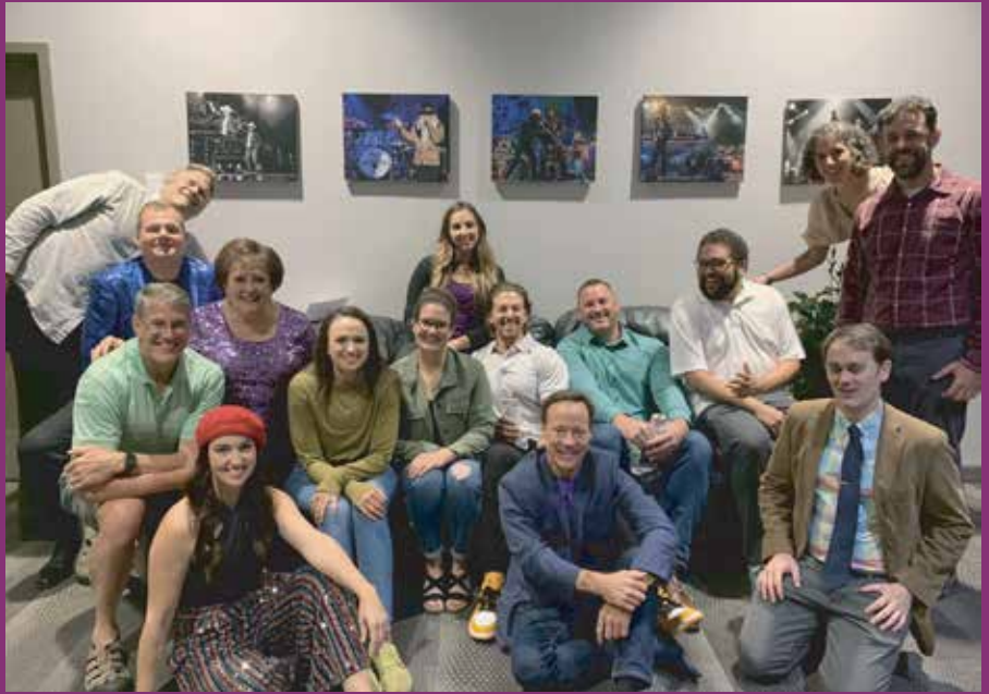
2022 WHOSE LINE IS IT MANKATO? PARTICIPANTS